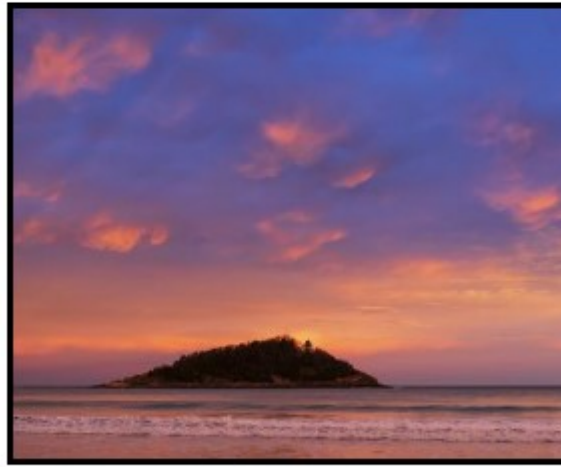
67094-Amanecer rojo en la playa con una isla en el fondo.

The number of people using the Mobile Web is huge; over 75 percent of consumers have access to smartphones. ??