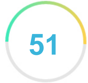
Your Website Score