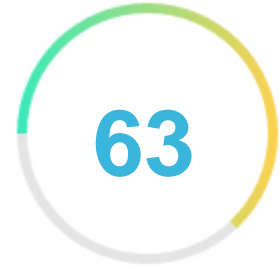
Your Website Score