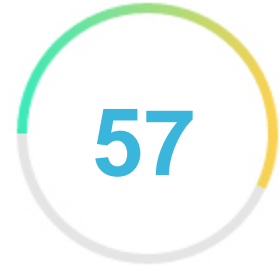
Your Website Score