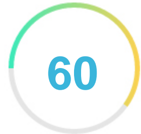
Your Website Score