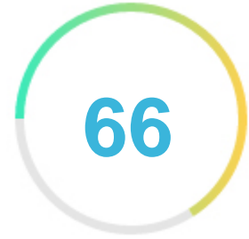
Your Website Score